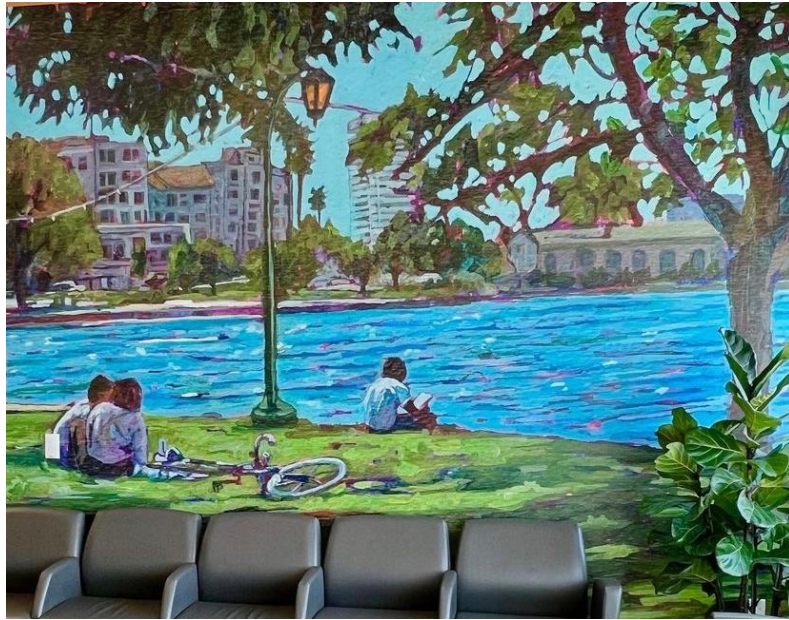
Meredith Steele, People Relaxing at Lake Merritt (2022). Original acrylic painting translated to supergraphic wall covering.